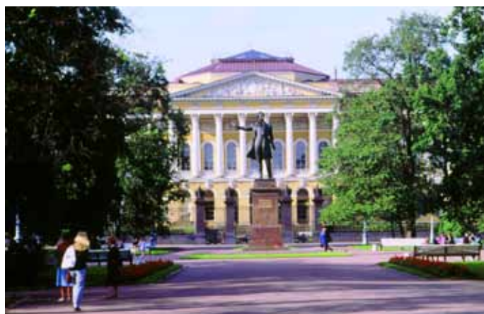
Russian Museum, St Petersburg.