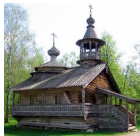
Museum of Wooden Architecture, Novgorod