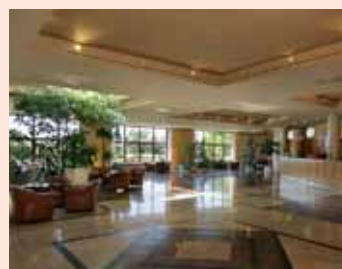
Park Inn Novgorod ★★★★

NB. Hotels of a similar standard may be substituted.