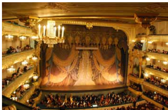
Mariinsky Theatre, St Petersburg