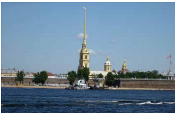
Peter and Paul Fortress, St Petersburg.

You can find a copy of the full terms & conditions attached to the Renaissance Tours booking form. They can also be found on our website or we would be happy to post you a copy on request.