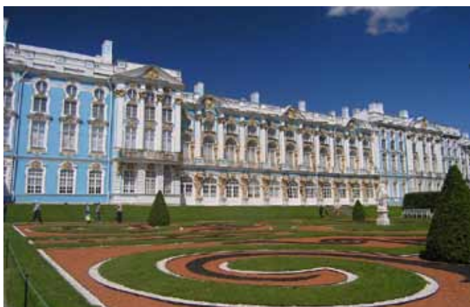
St Catherine's Palace, Pushkin

After lunch, continue to Dostoyevsky's Apartment , where the writer lived between 1878 and 1881 and which is filled with memorabilia relating to his life and work. Dostoyevsky based many of his stories and novels in the Vladimirsky region of the city where his apartment is located. Finish with a visit to the House of Anna Akhmatova , one of the greatest of Russia's 20th century poets. (BL)