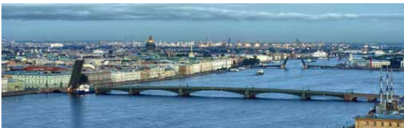
Palace Bridge, St Petersburg

NB. Hotels of a similar standard may be substituted.