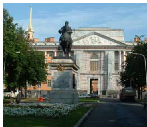
Mikhailovsky Palace, St Petersburg