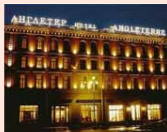
Angleterre St Petersburg ★★★★