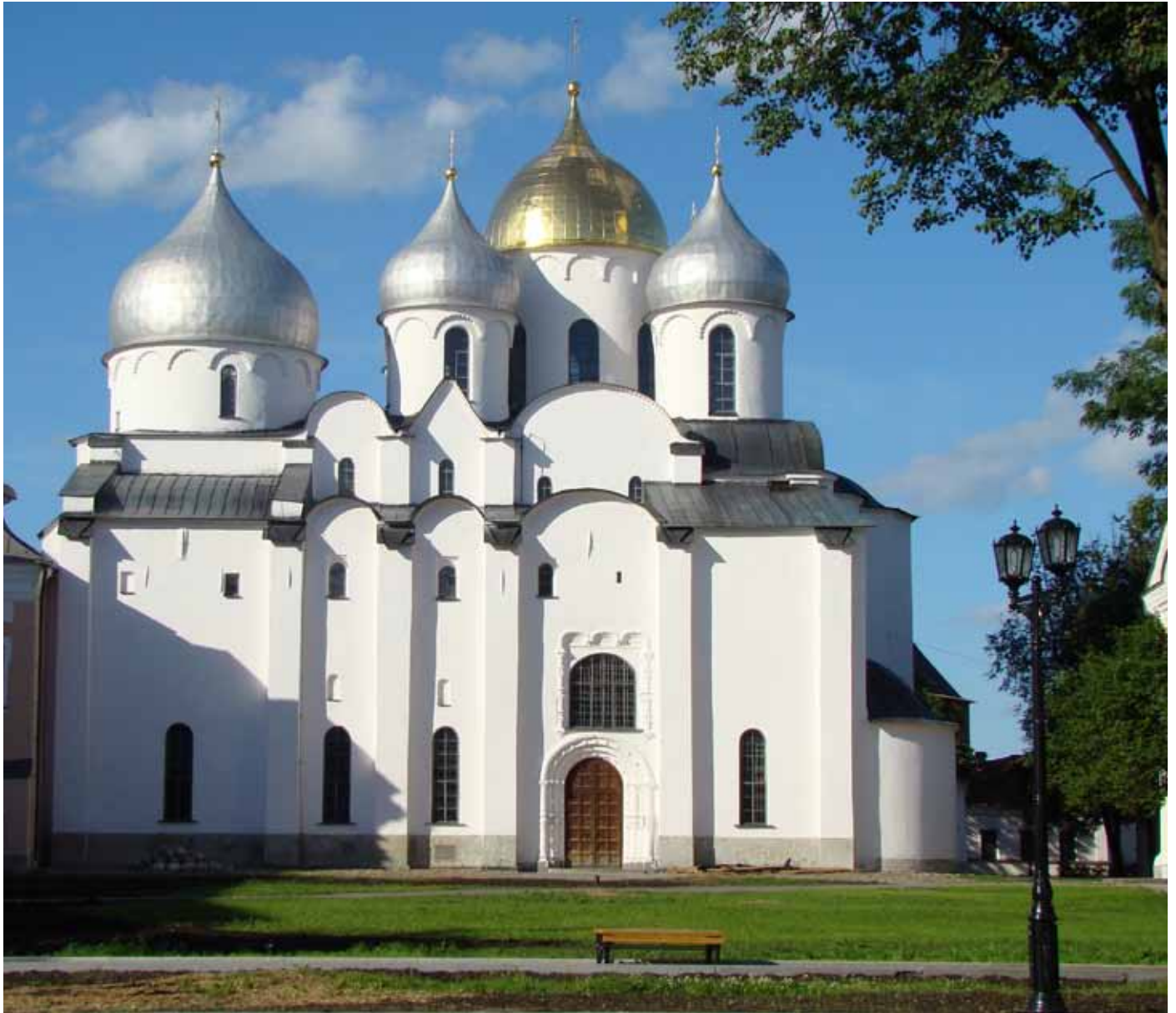
Cover image: Peterhof Palace, St Petersburg Back page image: Saint Sophia Cathedral, Novgorod.