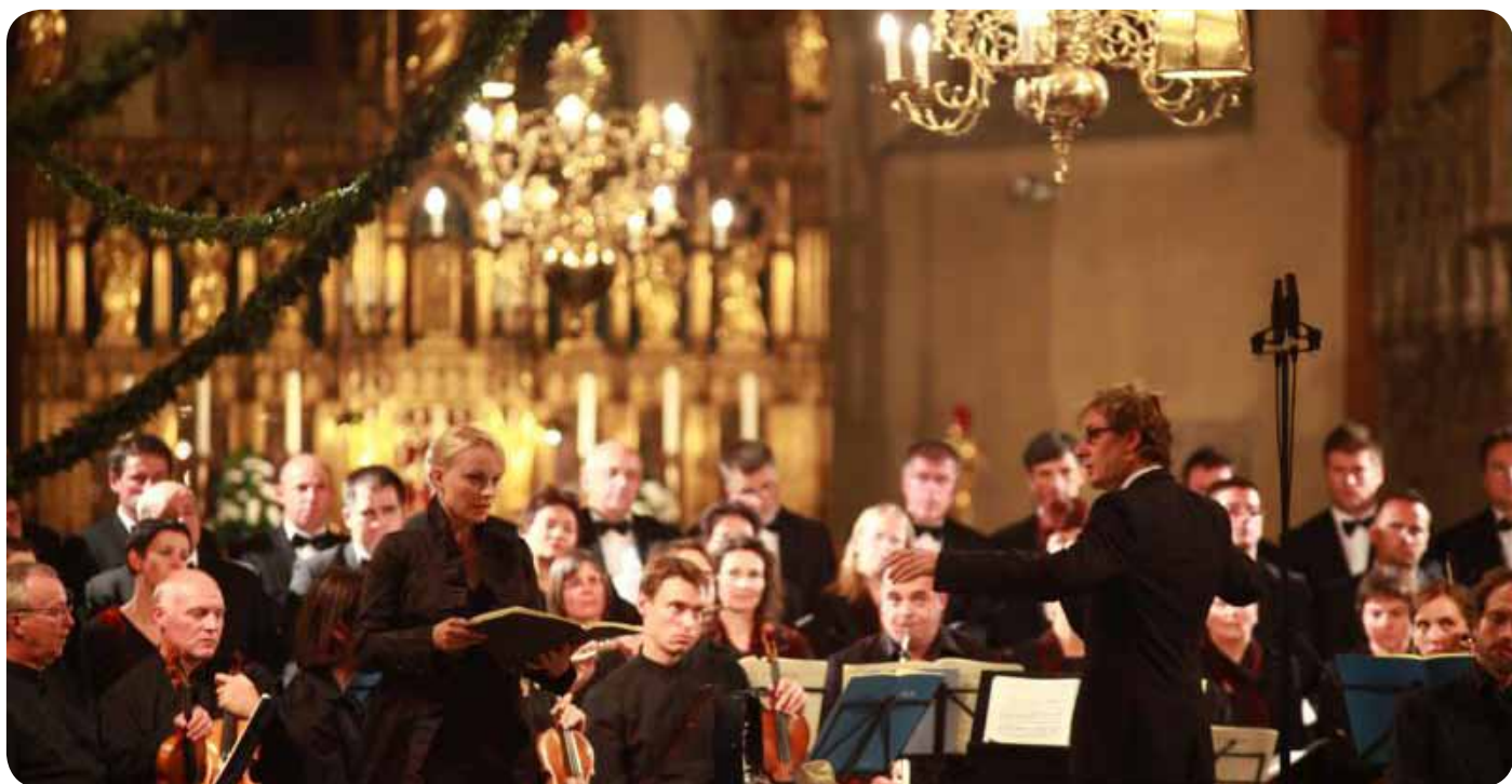
Concert in Maribor Cathedral

You can find the full terms & conditions on the Renaissance Tours booking form. They can also be found at www.renaissancetours.com.au or we would be happy to post you a copy on request.