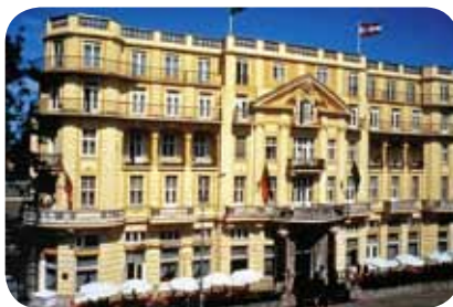
Parkhotel Schönbrunn Vienna