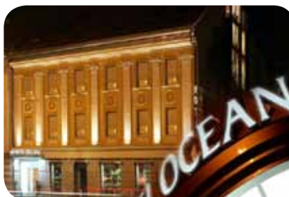
Grand Hotel Ocean Maribor