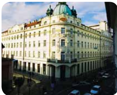
Grand Hotel Union Executive Ljubljana