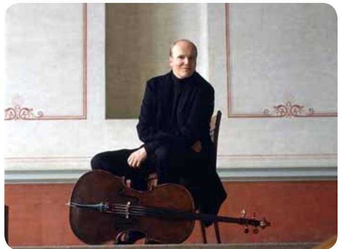
Truls Mørk

Grafenegg Festival is a new event by European festival standards (the first Grafenegg Festival was held in 2007). This prestigious annual summer festival takes place over four weekends in August and September in the grounds of the historic 19th century Grafenegg Castle, about an hour's drive from Vienna. The artistic director is acclaimed Austrian pianist Rudolf Buchbinder and the festival's program consists of symphonic and chamber music as well as recitals. International guest orchestras perform as well as the Austrian Tonkünstler Orchestra, which serves as 'orchestra in residence'. Performances take place both on an open-air stage called the Wolkenturm as well as in an indoor concert hall.