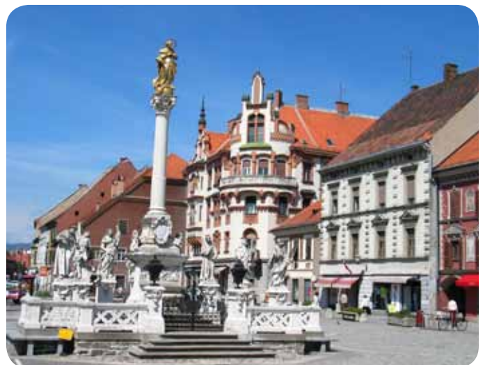
Maribor

In 2008, the festival became known as the Maribor Festival and Richard Tognetti, Australian violinist, and leader and Artistic Director of the Australian Chamber Orchestra, took up the position of Artistic Director for a six year term, to culminate in the 2012 Festival as part of Maribor's status as European Cultural Capital. Under Tognetti the number of concerts has increased and, in addition to chamber music concerts, the program also contains symphonic works following the introduction of an orchestra-in-residence. In true Tognetti style, the festival program is always adventurous, eclectic and thought provoking. Expect to be very pleasantly surprised! For further information: http://en.festivalmaribor.com