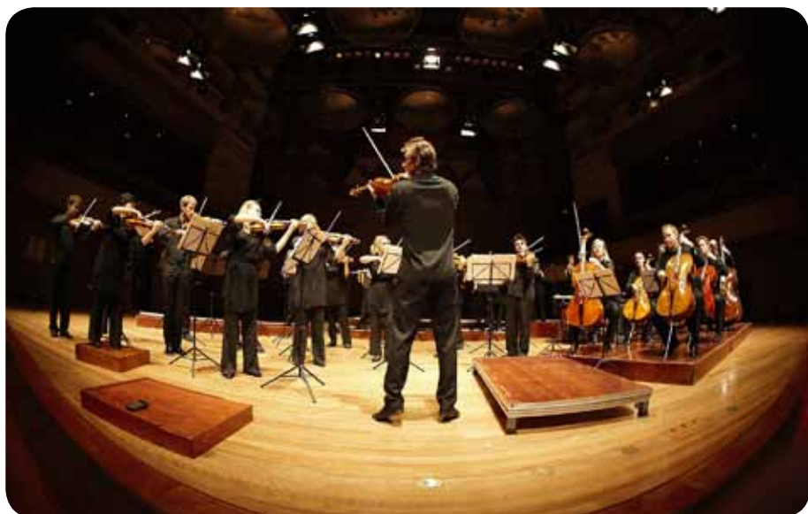
Australian Chamber Orchestra