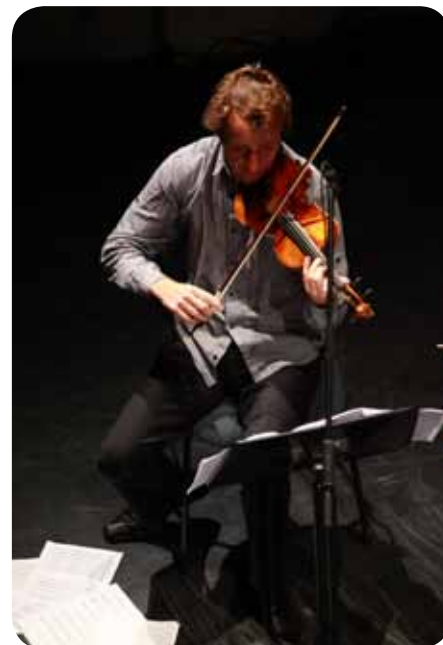
Richard Tognetti

NB: Hotels of a similar standard may be substituted.