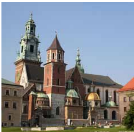
Wawel Castle, Krakow

NB. Hotels of a similar standard may be substituted.