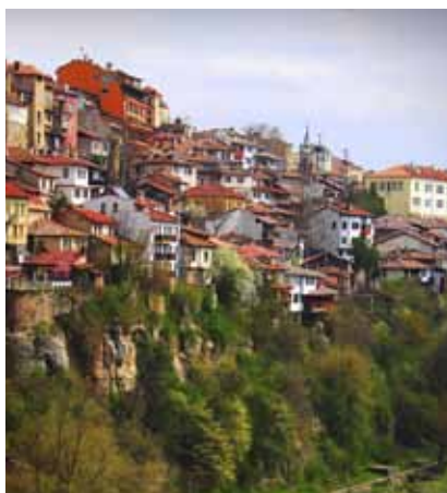
Veliko Turnovo, Bulgaria