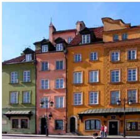
Old Town, Warsaw