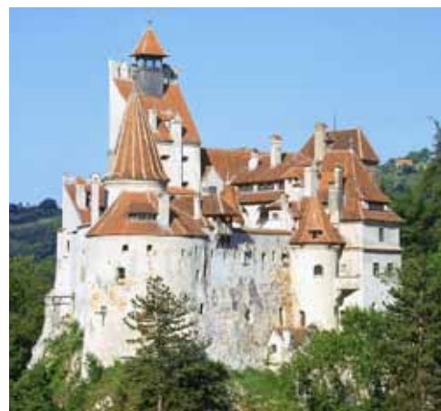
Bran Castle, Brasov