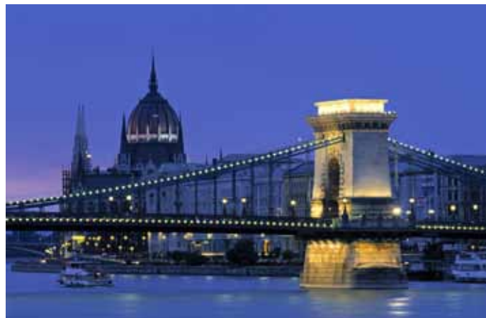
Chain Bridge, Budapest

Tour arrangements conclude after breakfast. (B)