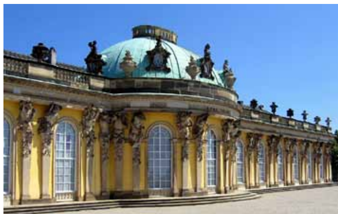
Sanssouci Palace, Potsdam