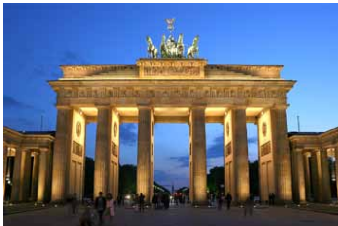
Brandenburg Gate, Berlin

Tour arrangements conclude after breakfast. (B)