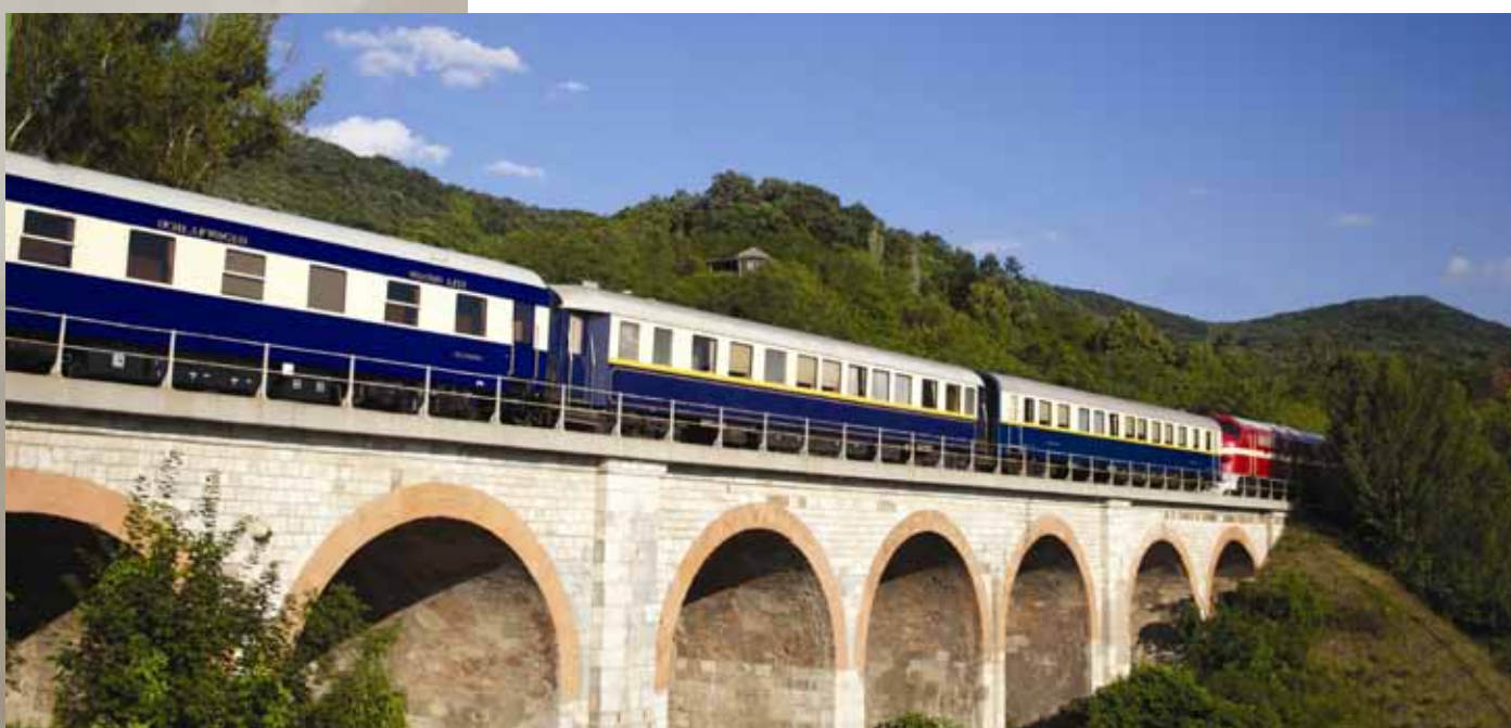
Danube Express on viaduct