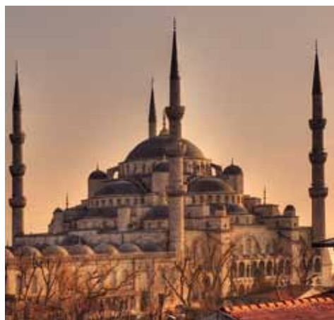
Blue Mosque, Istanbul

With a dramatic position straddling the Danube River, Budapest is made up of two cities – Buda and Pest. Begin your exploration of the city at the Castle District atop Buda Hill, dominated by the 18th century neo-Baroque Royal Palace and historic St Matthias's Church. Enjoy spectacular views from Fisherman's Bastion before crossing to the Pest side where you will see the Parliament Building, the Hungarian Opera House, St Stephen's Cathedral and Heroes' Square.