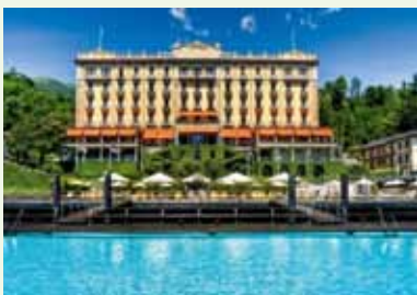
Grand Hotel Tremezzo