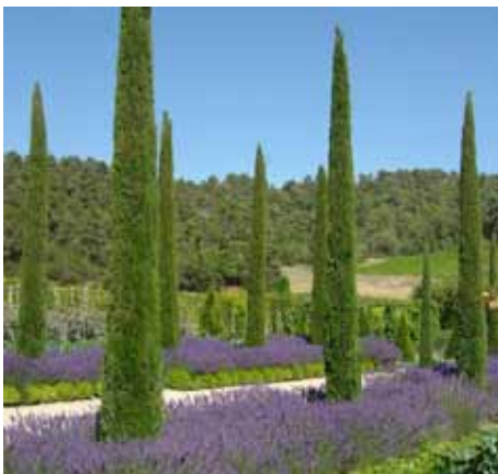
Château Val Joanis

Today the garden contains approximately 2,500 trees and shrubs in its collections, representing some 1,600 exotic species from the Mediterranean or hot climate countries including South Africa, Australia, California, Chile and Mexico as well as China, Japan, and New Zealand. The garden contains fine collections of cycads, conifers and an exceptional collection of cypress.