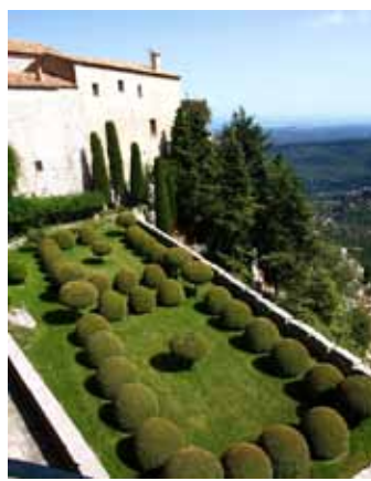
Château de Gourdon