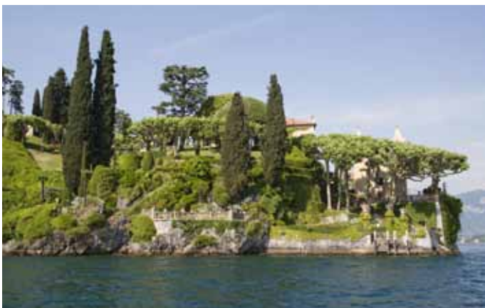
Villa del Balbianello