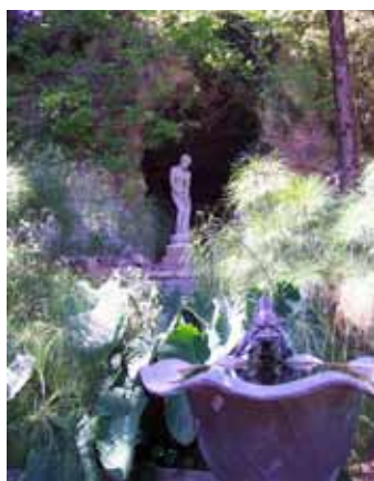
Hanbury Botanic Gardens