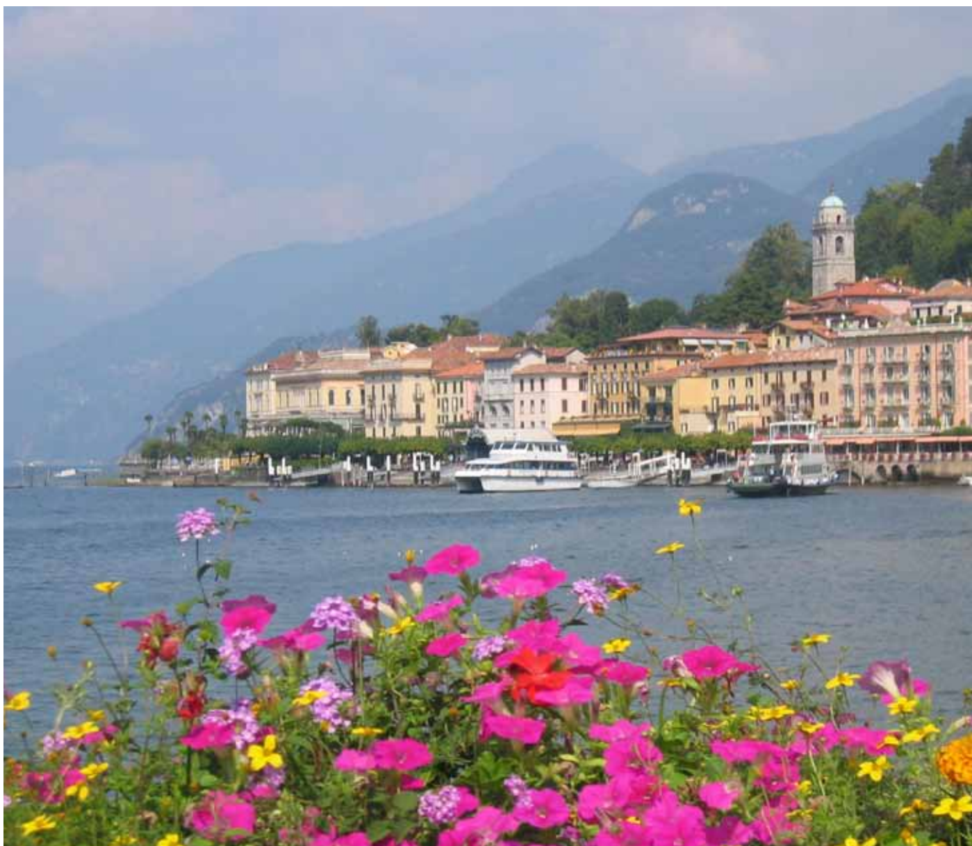
Cover image: Serre de la Madone, Menton. Back page image: Bellagio, Lake Como.