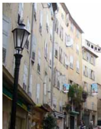
Grasse Old Town