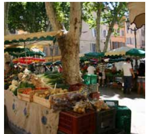
Markets in Aix-en-Provence