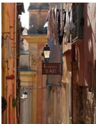
Menton Old Town

* Visits to private gardens are subject to confirmation by the owners.