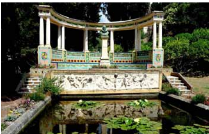
Fontana Rosa, Menton