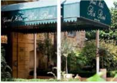
Grand Hôtel Roi René