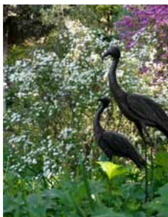
Clos du Peyronnet