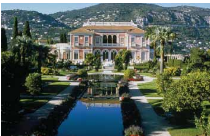
Villa Ephrussi de Rothschild