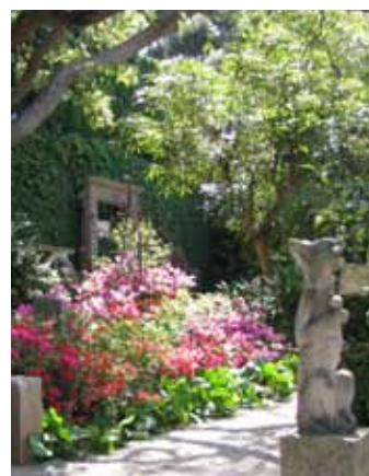
Villa Ephrussi de Rothschild