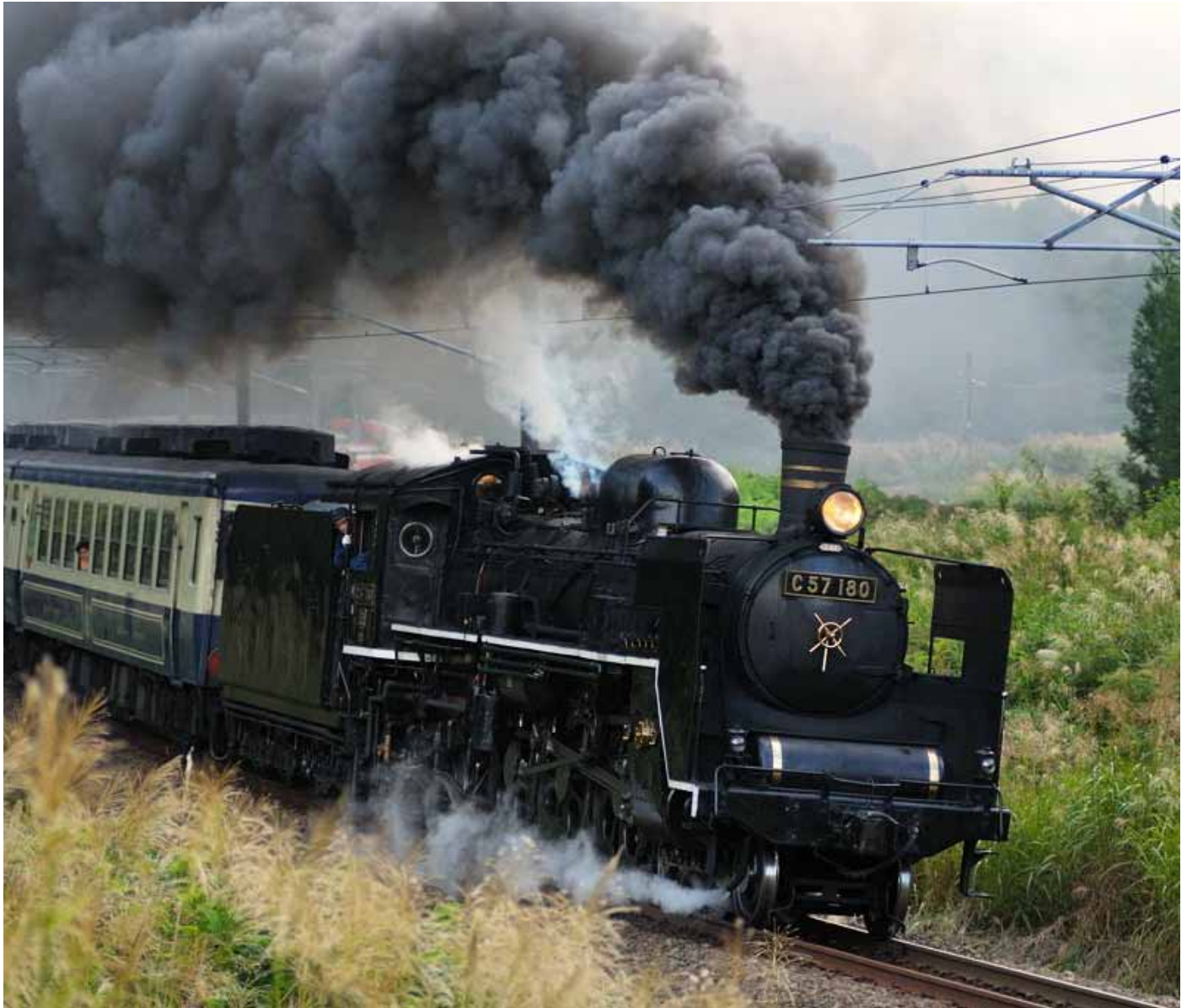
Cover image: Shinkansen passing by the Mount Fuji Back page image: Ban'etsu C57 180