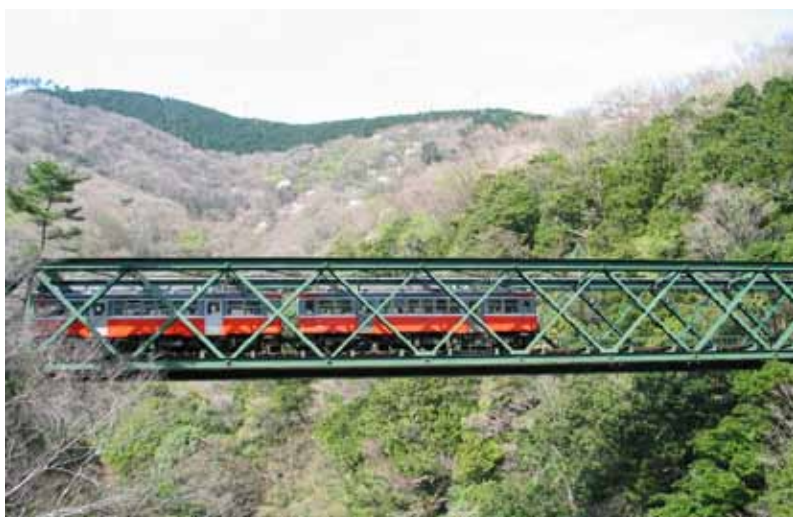
Hakone Mountain Railway

You can find the full terms & conditions on the Renaissance Tours booking form. They can also be found at www.renaissancetours.com.au or we would be happy to post you a copy on request.