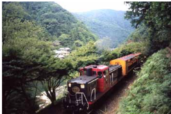
Sagano Scenic Railway

Journey out of Sapporo by express train and coach to Daisetsuzan, Hokkaido's largest national park (approx. 2hr 15min, one-way). The park preserves a densely forested, mountainous area of virtually unspoiled wilderness. You will explore the national park by road and also take the Mount Kurodake Ropeway to admire the view from 1,984 metres above sea level. (BL)