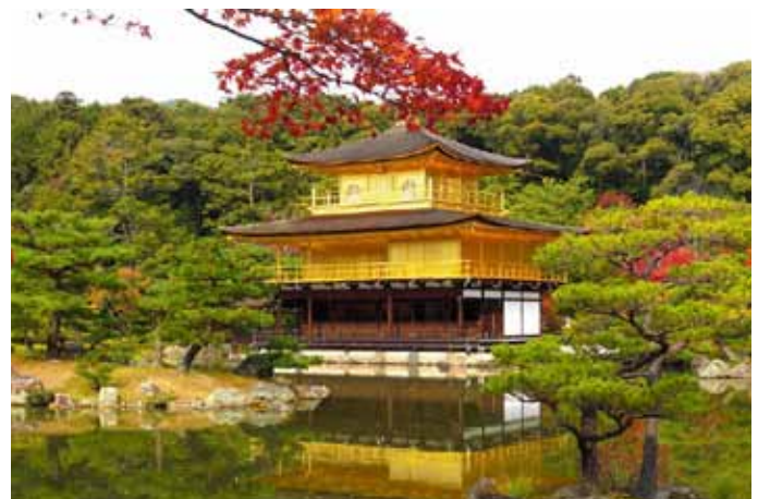
Golden Pavilion Kyoto