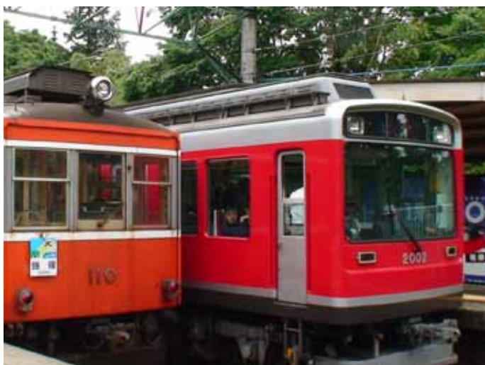
Hakone Tozan Railway

NB: Hotels of a similar standard may be substituted.