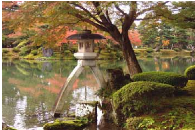
Kenrokuen Garden, Kanazawa

Morning at leisure. Transfer to Sapporo Airport for afternoon departure on Cathay Pacific flight CX581 to Hong Kong, connecting with overnight flights to Australia (overnight in Hong Kong required for passengers from PER). (B)