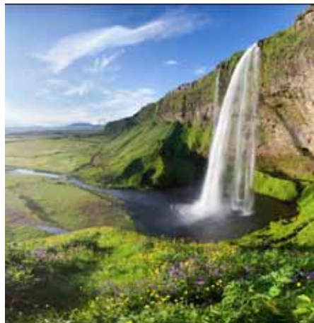
Seljlandsfoss Waterfall, Iceland