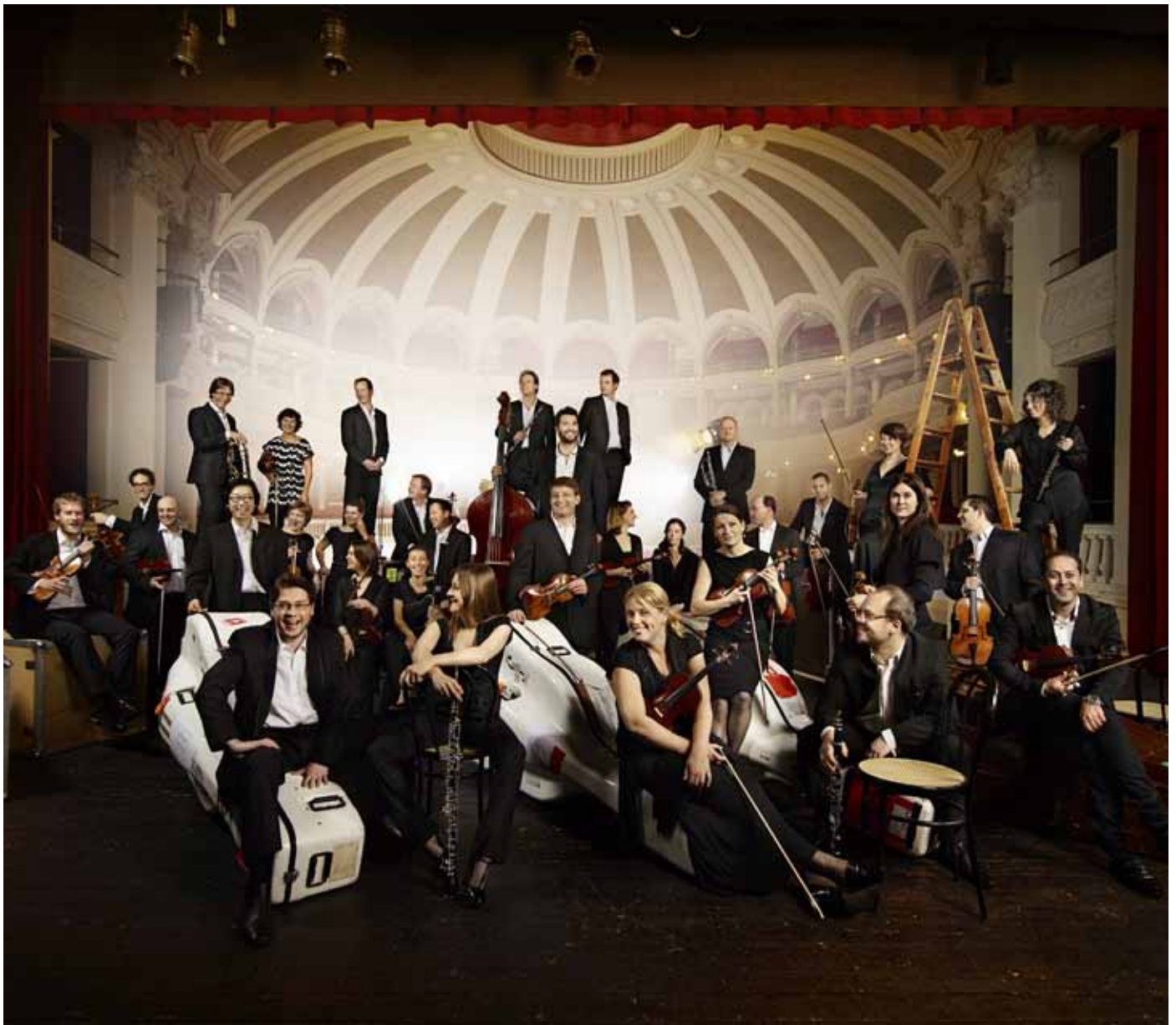
Front image: Geiranger Fjord, Norway Back image: Mahler Chamber Orchestra