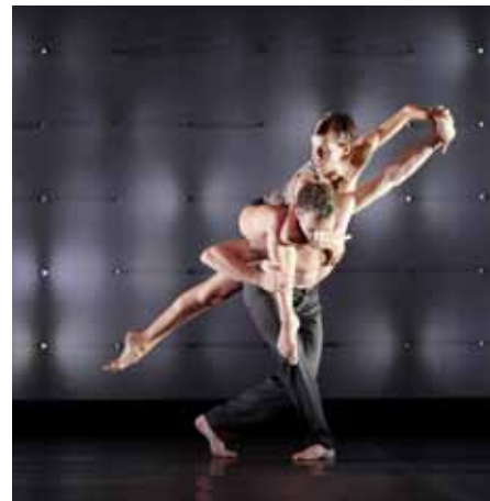
FAR by Wayne McGregor's Random Dance