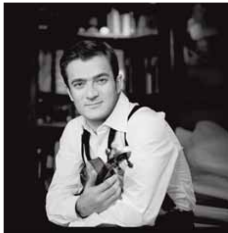
Renaud Capuçon