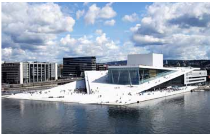
Oslo Opera House

You can find the full terms & conditions on the Renaissance Tours booking form. They can also be found at www.renaissance-tours.com.au or we would be happy to post you a copy on request.