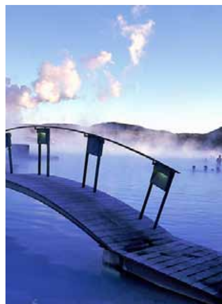
Blue Lagoon, Iceland