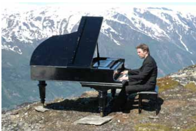
Leif Ove Andsnes