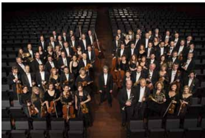
Oslo Philharmonic Orchestra

Morning tour of Bergen, including the old Hanseatic warehouses at Bryggen, Haakon's Hall completed in 1262 and the Rosenkrantz Tower dating back to the 15th century. Pass the bustling market place with its famous fish market and the old, white wooden houses