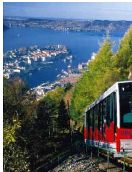
Bergen funicular

NB: Hotels of a similar standard may be substituted.