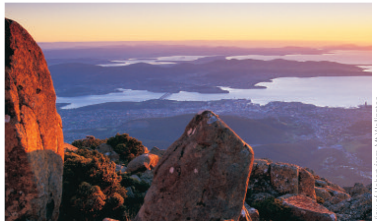
View of Hobart from Mt Wellington

This fully guided half day cruise on board the luxury catamaran, Peppermint Bay II , provides a real connection with the Tasmanian lifestyle. Take in the glorious scenery, dotted with sea eagles and sun basking seals. Flat screen plasma televisions beam back images from