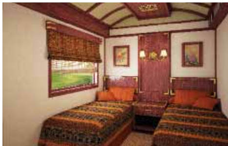
Deluxe twin bedroom