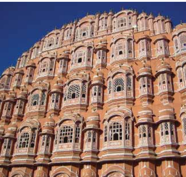
Hawa Mahal – Jaipur