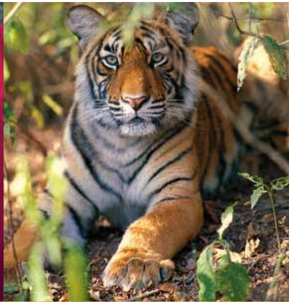
Ranthambore National Park