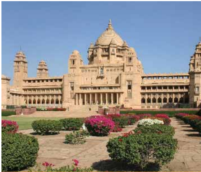
Umaid Bhawan Palace – Jodhpur