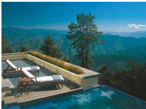
Wildflower Hotel – Shimla

Morning transfer from the hotel to Shimla Airport for a midday flight (1 hr 20 min) to Delhi where you are met and transferred to your hotel. Evening at leisure. (B)