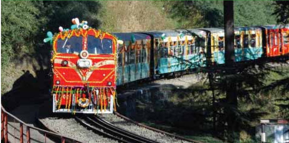
Kalka – Shimla Railway