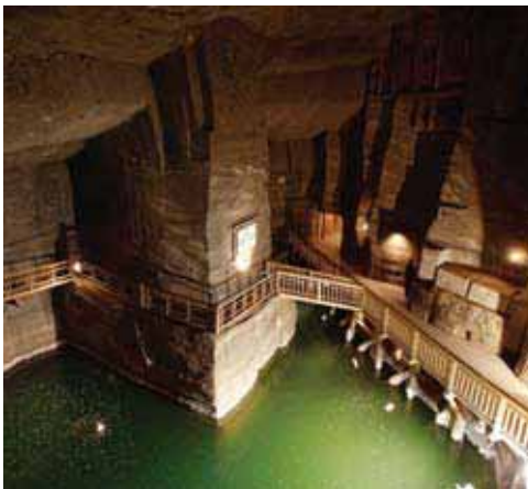
WIELICZKA SALT MINE