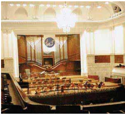
PHILHARMONIC HALL, WARSAW