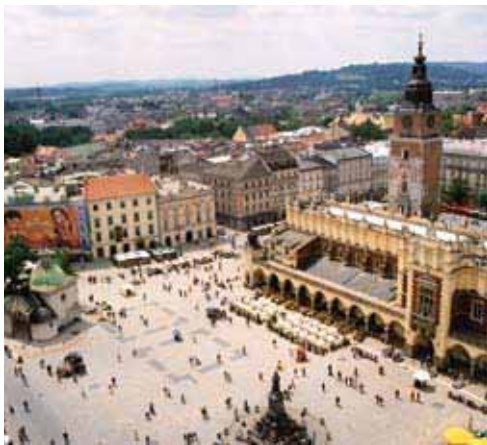
KRAKOW MARKET SQUARE