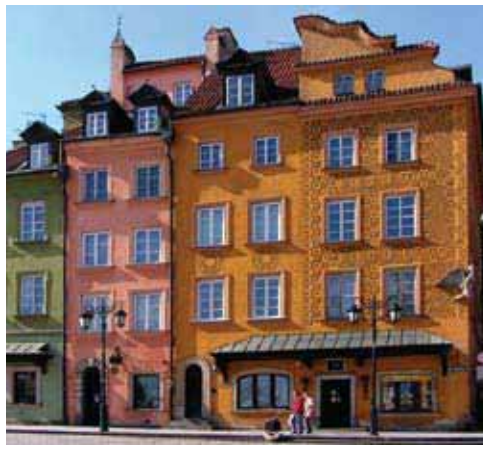
RESTORED HOUSES, WARSAW