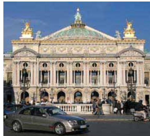
PALAIS GARNIER, PARIS