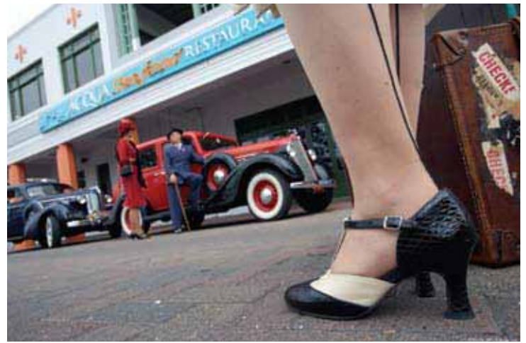
ART DECO CITY OF NAPIER

Finish with a guided tour through the award winning Rotorua Museum. View fascinating exhibits showcasing Rotorua's vibrant volcanic and cultural history included in a short film of the history of Rotorua. Afternoon at leisure (B)