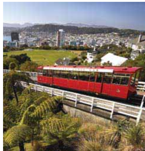
WELLINGTON CABLE CAR | IAN TRAFFORD

Today experience the scenic beauty of Rotorua's lakes and learn about the history and culture of Rotorua and the devastation caused by the eruption of Mount Tarawera in 1886. See five of Rotorua's surrounding lakes including a view to Mount Tarawera across Lake Tarawera. Wander around the famous buried village of Te Wairoa.