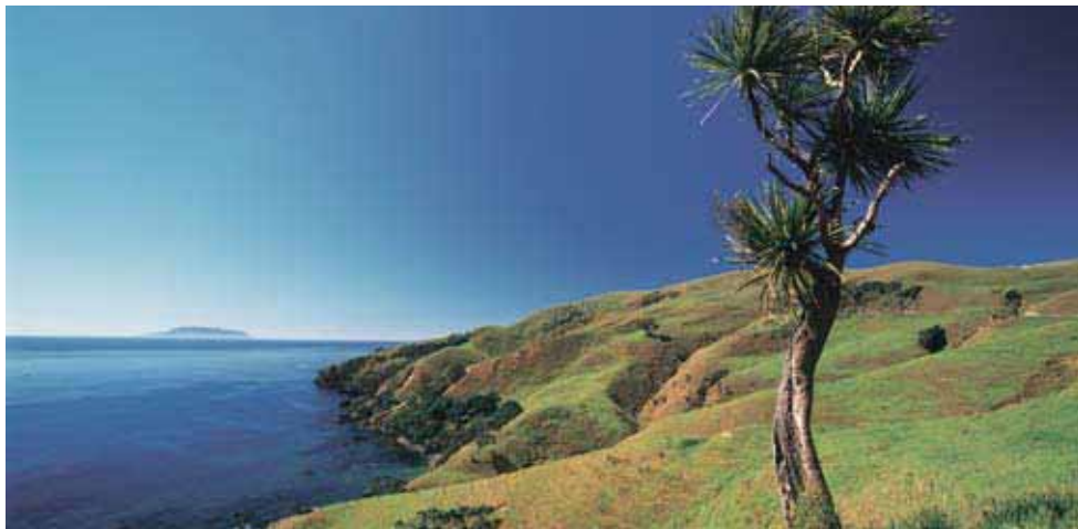
COROMANDEL PENINSULA