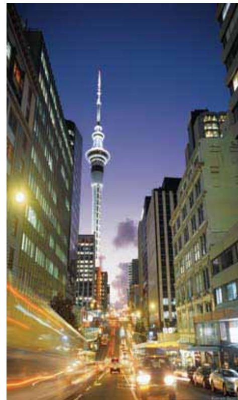
AUCKLAND CBD

You can find a copy of the full terms and conditions attached to the Renaissance Tours booking form. They can also be found on our website at: www.renaissancetours.com.au or we would be happy to post you a copy on request.